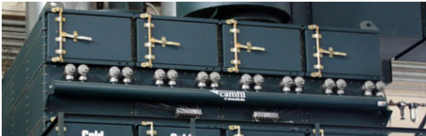
The Integrated HEPA Safety Monitoring Filter is mounted on top of the Gold Series.