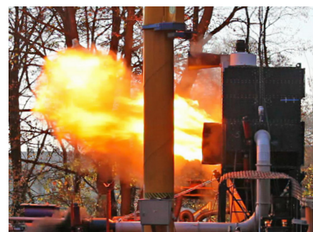
During explosion in a Gold Series, no flames come out of the exhaust pipe. The inlet pipe is protected by a backdraft damper.

Qualified as a Flame Front Arrestor, which describes the passive isolation allowed as prescribed in Chapter 12 of NFPA 69. It also details the test procedure and results of subjecting the Gold Series X-Flo with iSMF to multiple, controlled and measured internal explosions. This technical report is available upon request.