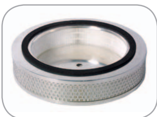
Optional HEPA Filter