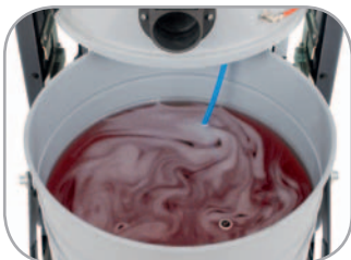
Liquid cut-off system (optional)