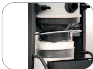
Longopac® Collection System